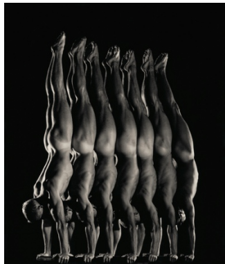
NDGT #1, 2001

The Exhibition will highlight over twenty years of work and we are honored and pleased to share this with you.